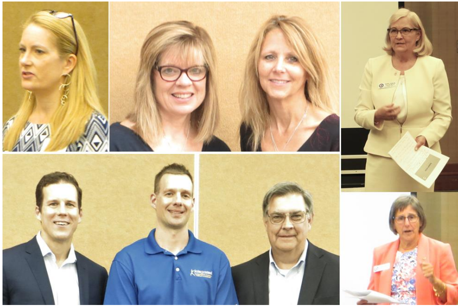
ABOVE – Seminar Presenters

BOTTOM: Some of the clerks attending the seminar.