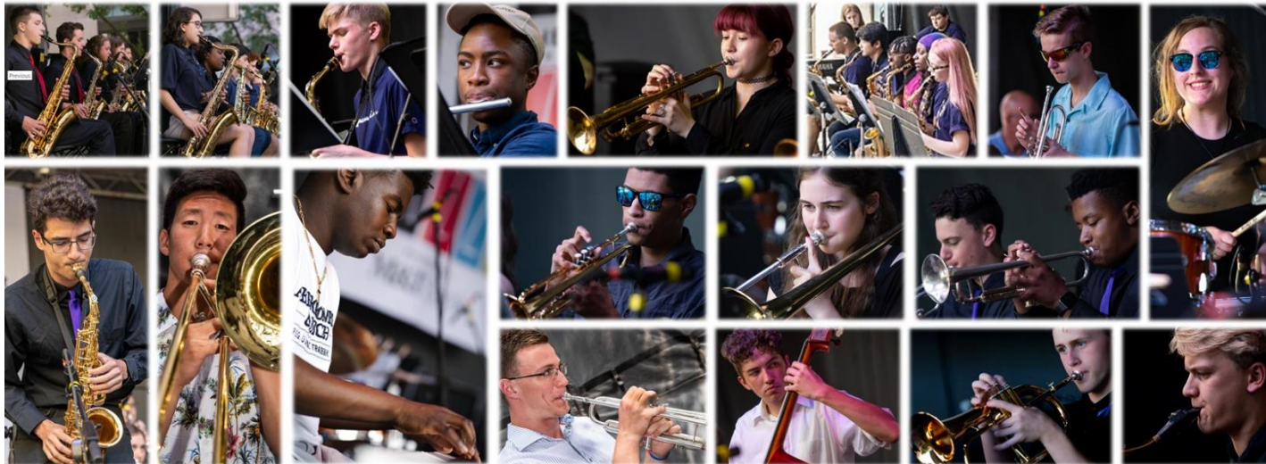
Seen are some of the MCSBA jazz musicians performing on the Jazz Street stage during the festival as well as their view of the audience

Musicians in 16 jazz ensembles representing 13 MCSBA districts performed in the 2019 Rochester International Jazz Festival during the last week of June. The RIJF has become one of the world's leading jazz festivals, providing the students an opportunity to perform before large appreciative audiences and to serve as envoys for our fine music programs with professional musicians. Our jazz bands have performed in the RIJF since its inaugural year in 2002.