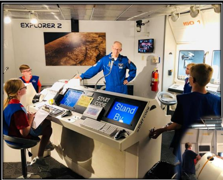
ABOVE: Students participating in simulated space travel at the Challenger Center in its former location in the RMSC.

Greater Rochester began. By the following week, components were being moved from the RMSC to the Center's new location.